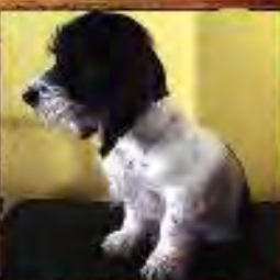
"Parti" Jaren's Red Solo Cup

("Cash" - CH. Chouan Finder's Keeper X "Brooks" - GCH. Jaren's Put A Girl In It)