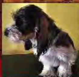
"Brewski" Jaren's Boys 'Round Here